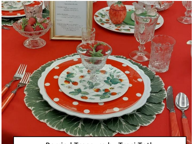
Berried Treasure by Traci Toth