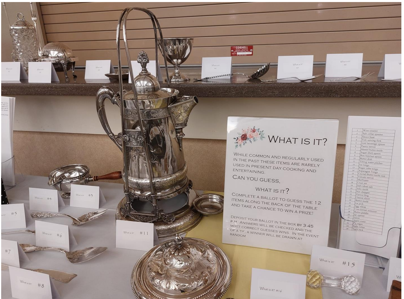
One of our most popular displays, "What is it?" a table full of items while commonly used in the past for cooking and entertaining are rarely seen today. Guests enjoy guessing what the items are or are used for.