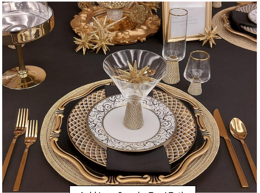
Auld Lang Syne by Traci Toth