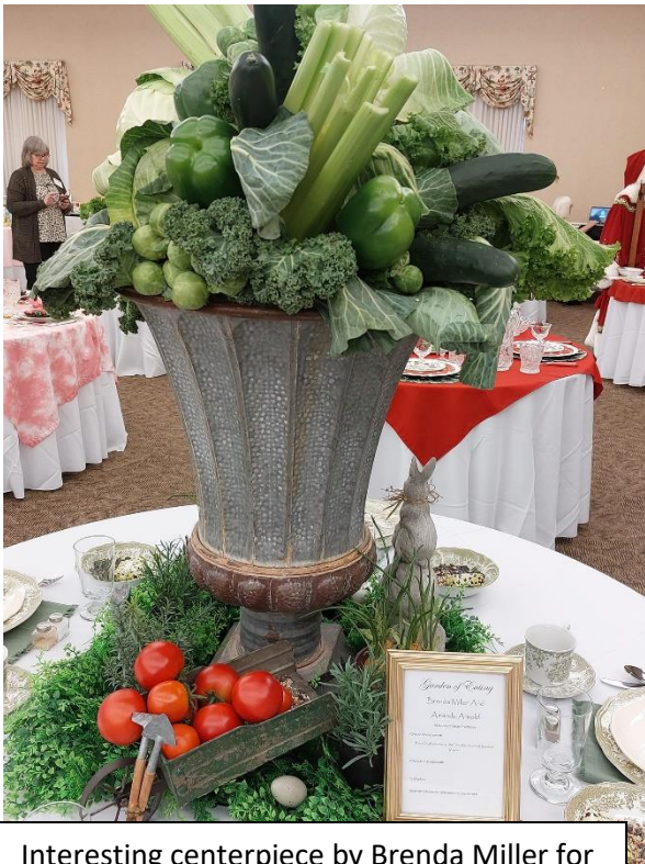
Interesting centerpiece by Brenda Miller for her table titled "Garden of Eating"