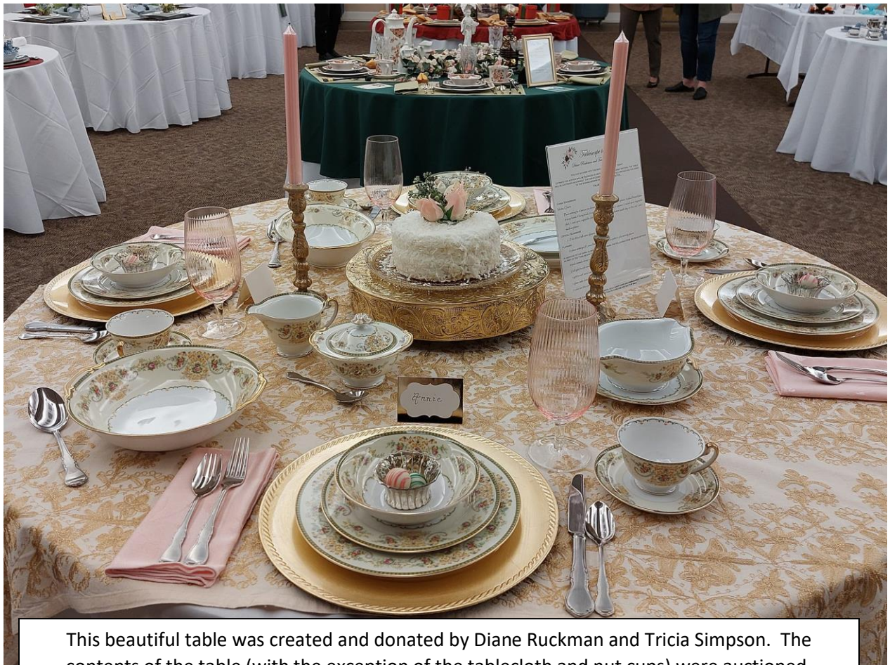
This beautiful table was created and donated by Diane Ruckman and Tricia Simpson. The contents of the table (with the exception of the tablecloth and nut cups) were auctioned.