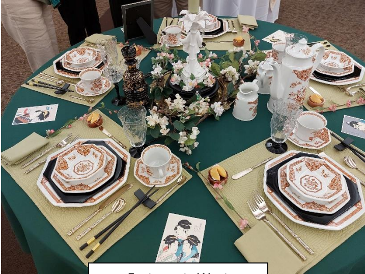
East meets West By Patty Taylor