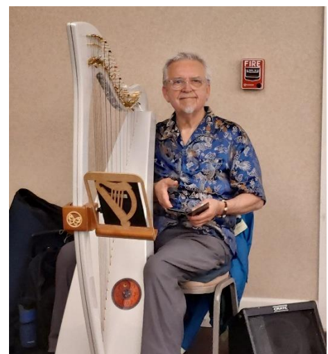
Beautiful background harp music provided by Allen Dec